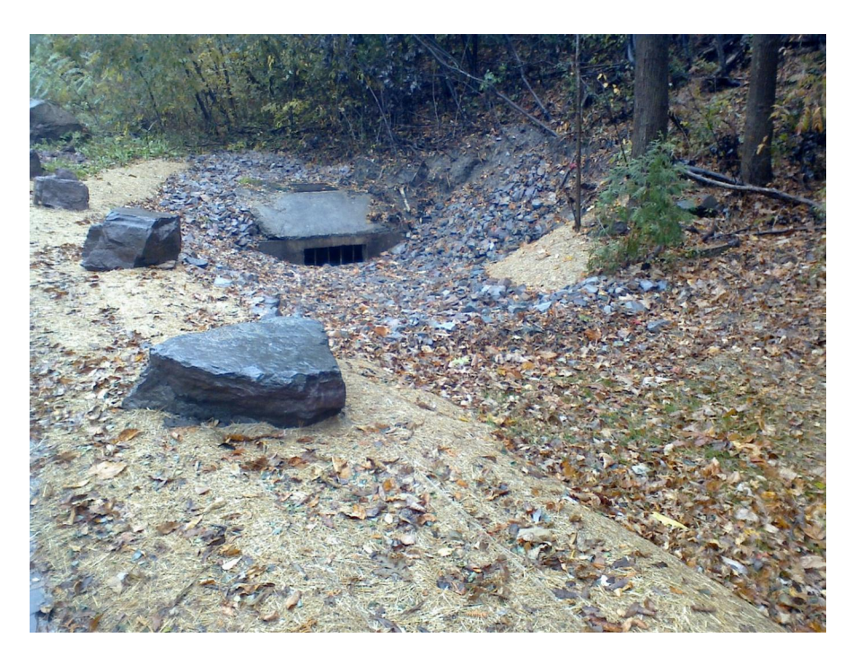
Improved swale along Flynn Ave and surface flow entrance into CB {\bf 3}