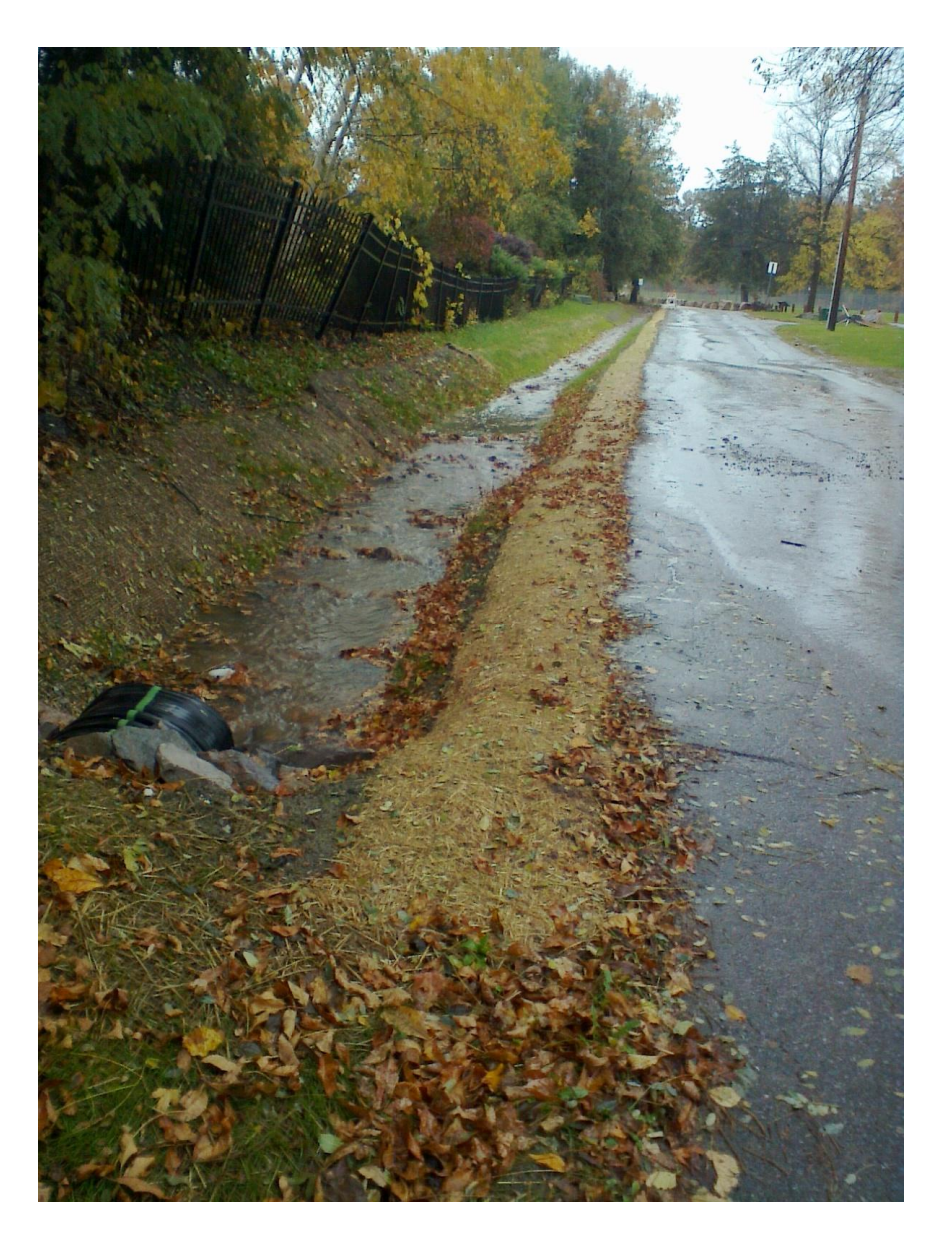
Improved swale during October 19 rain storm

Photo Documentation of Blanchard Beach Water Quality Improvements & Wetland Restoration Burlington, VT (October 2012)