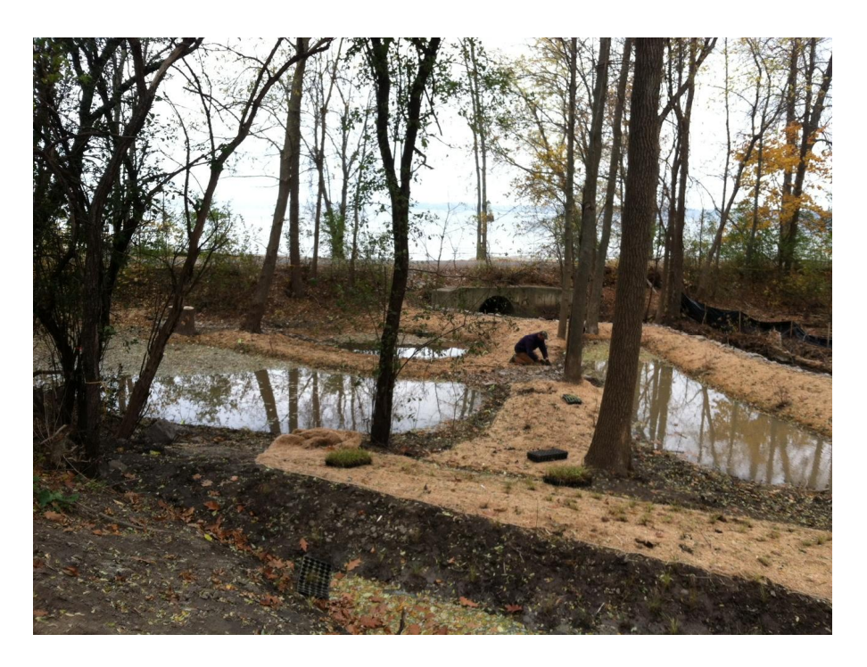
Oakledge Tributary Wetland Cells