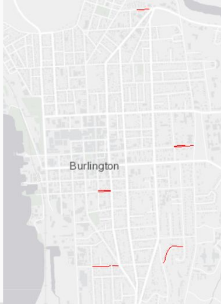
CURB 2018: ~8 segments