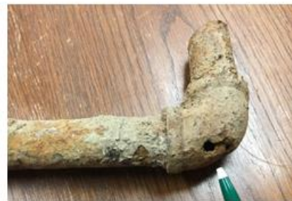
The photos above depict failed galvanized service lines in Burlington.

You can determine the material type of your water service in the following ways: