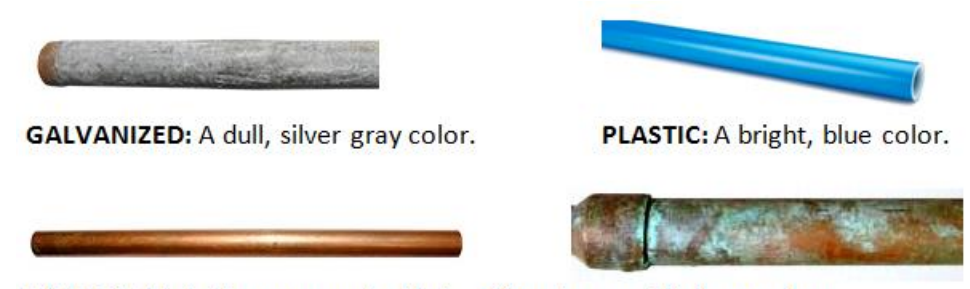
COPPER: A bright, copper color that oxidizes to a mottled green hue.

A water service (or lateral) is the pipe that connects your property to the City's water main located at in the street. The water service enters the property through the basement foundation or wall (usually on the street side) and connects to the water meter. They can be constructed from galvanized steel, plastic or copper.