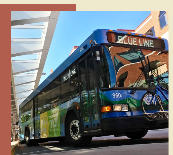
By ensuring alternative modes for transportation are accessible for all, BAC can advocate for a diverse aging population while also ensuring programs support vulnerable and marginalized populations.