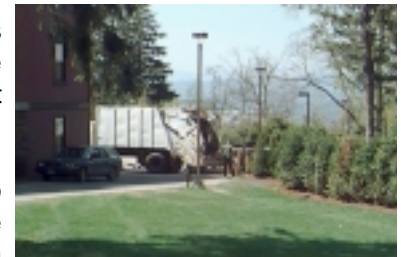
Dumpsters hidden in the back

Typically trash cans, recycling containers and dumpsters are unsightly. They must also be accessible and moveable. When incorporating them into your building and site plan, try to keep them hidden from view and out of the way of cars and people using the site.