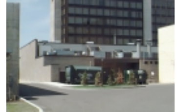
Mechanicals hidden on roof

Two easy solutions here are to group mechanicals together using the building's roofline to hide them from public view, and match the color to the roof. Sometimes a false-facade can be used to both enhance the building's roofline and shield rooftop equipment. Another option may be to place them in the rear of the property near a service entrance.