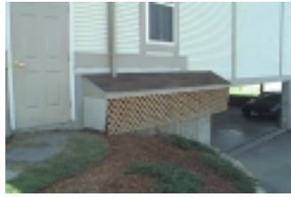
Hiding gas meters

facade. By simply moving them around the corner to a side can make all the difference in the public appearance of your building. In addition, by moving them just a few feet away from the corner, landscaping can be planted to screen them from the street, while still allowing easy access. If you have a lot of meters – say for an apartment house—make an enclosure of matching materials to the structure. Again, it hides the bank of meters and keeps the weather off them too.