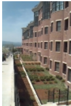
The "Big Things"

When planning a large, and even a small project, most of our time and energy goes into the big things. Where should the buildings go? What type of use will fit best? What size addition should we build? We try to take things "one step at a time" and typically don't worry about the details until the very end.