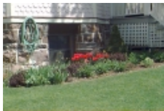
The "Little Things"

Design Review asks us to consider many of those "little things" early in the planning process. It is often those details that make the biggest difference. When pieces are added-on at the last minute, they typically look that way. The goal of Design Review is to help us think through a project, including some of the important details, to ensure all of the pieces of the puzzle fit together into one neat package. This care and thought will show through in the final product - adding lasting value to the property and its surroundings.