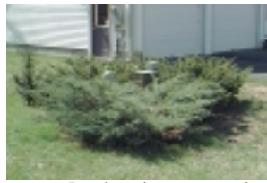
Landscaping as screening

One result of placing utilities such as power and telephone underground are the green boxes and domes that need to go on the ground. This is necessary equipment, and must be occasionally accessed by the utility company. Do you really want it right in front of your building – the one you just spent a lot of money to design and build? Simply moving them off to the side, or the back of the parking lot – still within