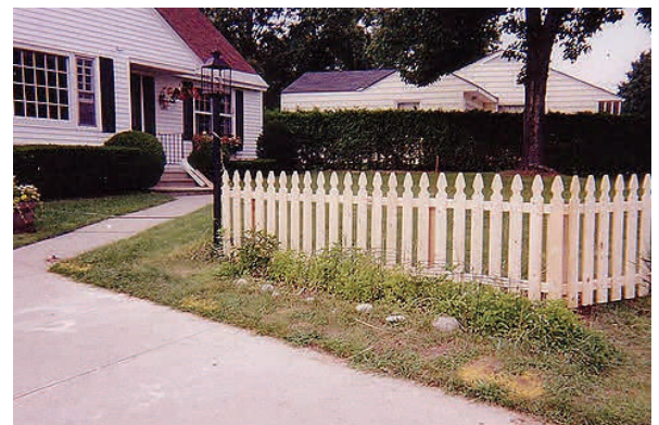
Decorative fence compliant with the clear site triangle!