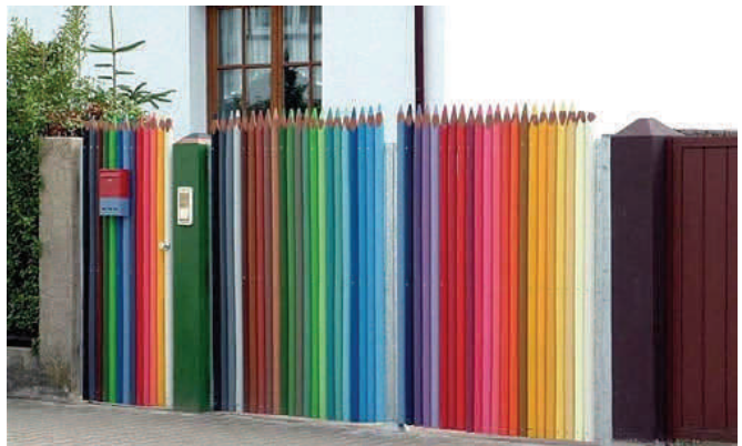
Fence compatible with context? Clear site triangle?

Styles, materials, and dimensions of the proposed fence shall be compatible with the context of the neighborhood and the use of the property.