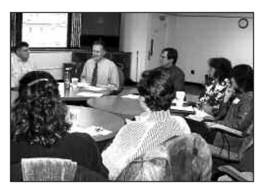
Mayor Kiss convenes one of his business roundtable meetings.