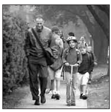
Mayor Kiss on Walk to School Day.

mum housing code inspections and investigating zoning violations.