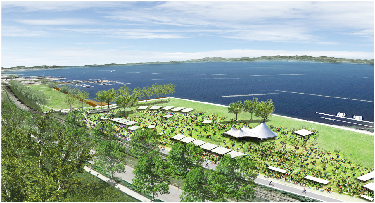
BIRD'S EYE VIEW REALIGNED PATH AROUND PERIMETER OF EVENT GROUNDS