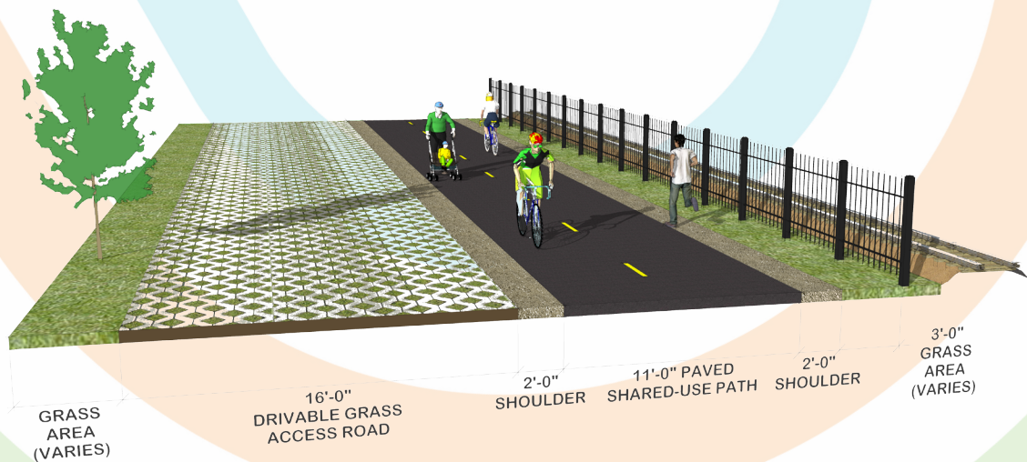
CROSS SECTION AT EVENT GROUNDS NEW PATH WIDTH STANDARD OF 2-11-2 (EVERYWHERE CONDITIONS PERMIT)