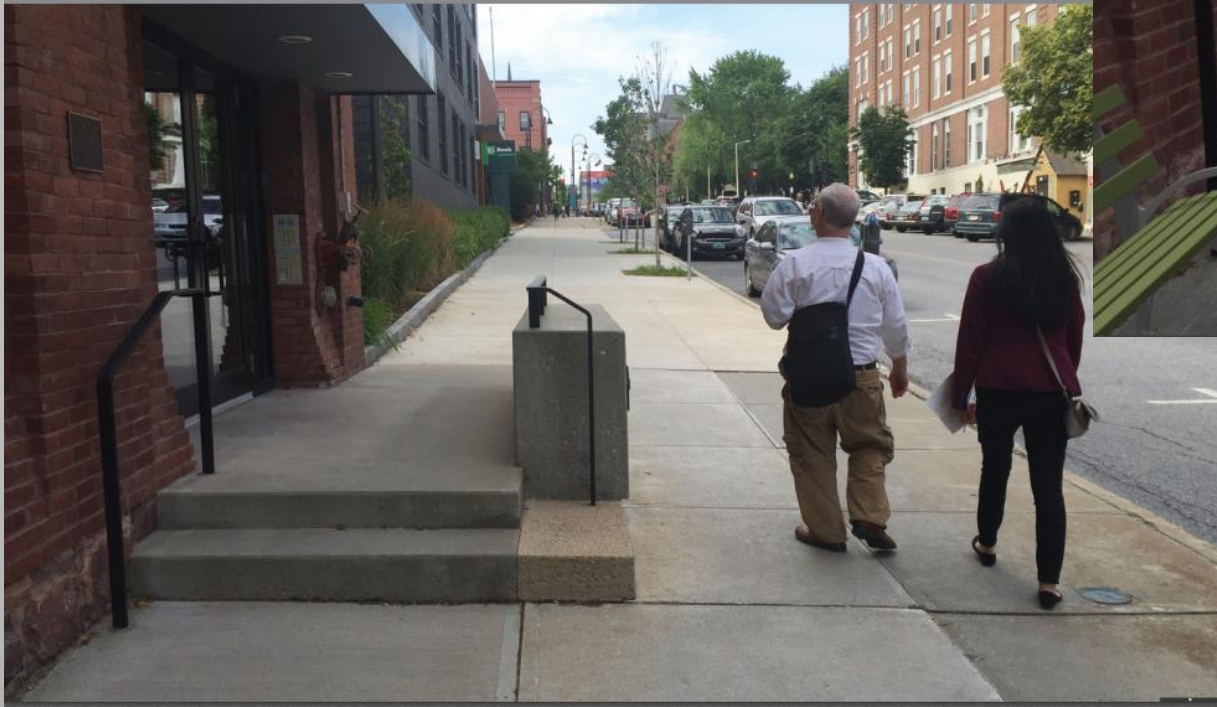
St Paul Street- Existing