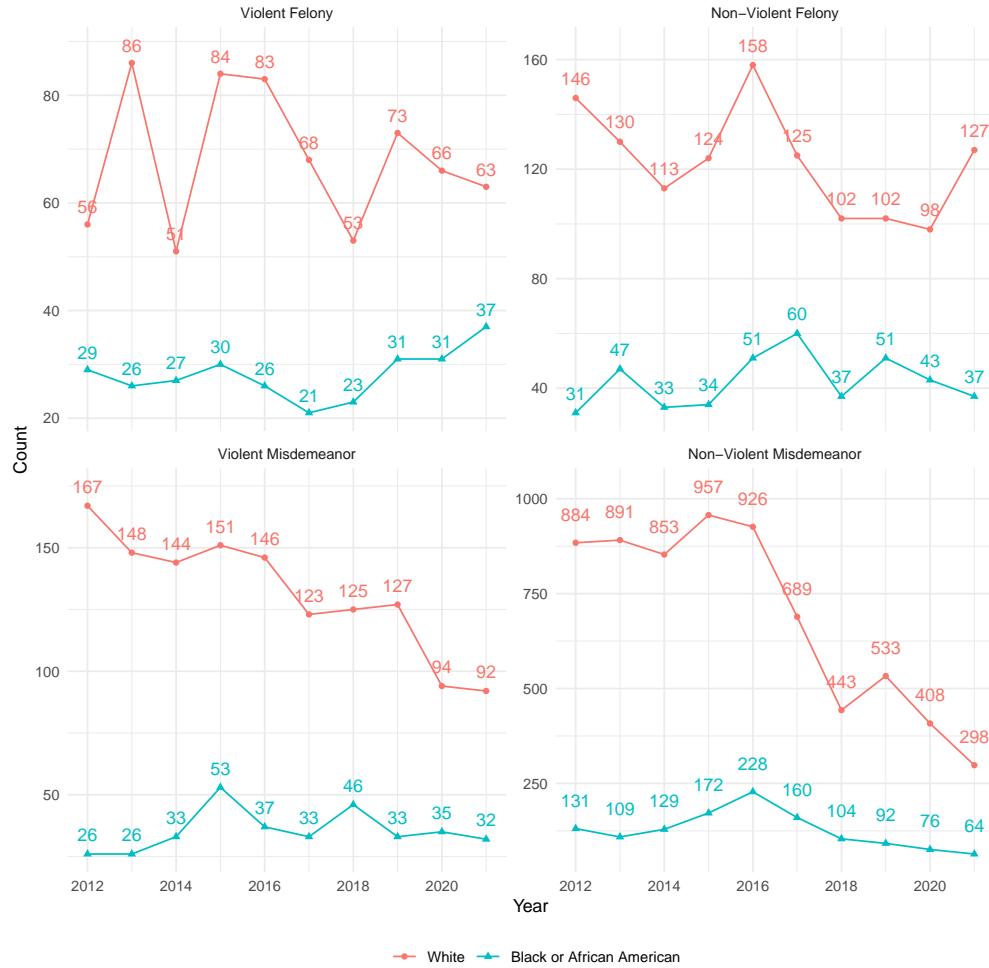
Figure 16: Number of arrests each year, by severity. Note that the vertical or y -axis is different for each plot. Some charges are misdemeanors or felonies depending on the specifics of the case, and are not represented in this plot.