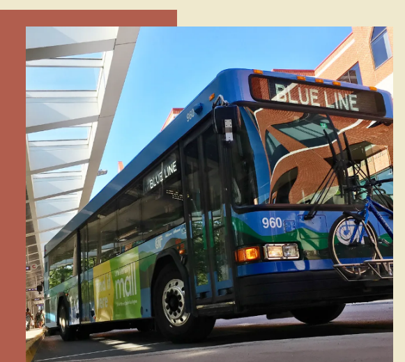
By ensuring alternative modes for transportation are accessible for all, BAC can advocate for a diverse aging population while also ensuring programs support vulnerable and marginalized populations.