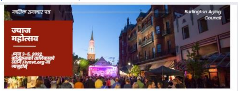
Appendix B: Nepali Translated Sample Newsletter