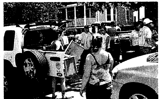
Spring Move Out Project