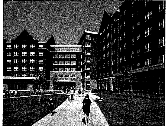
Central Campus Residence Hall