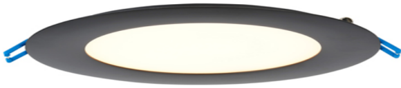
Type IC, Wet & Air-Tight