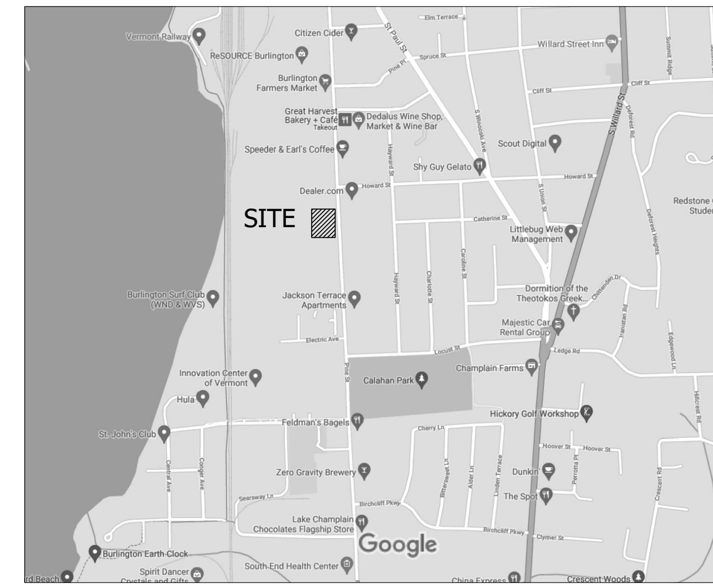
LOCATION MAP - NTS