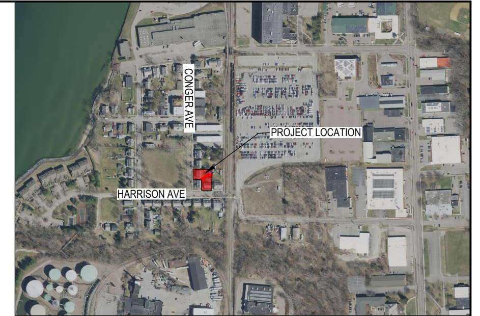
LOCATION PLAN N.T.S.