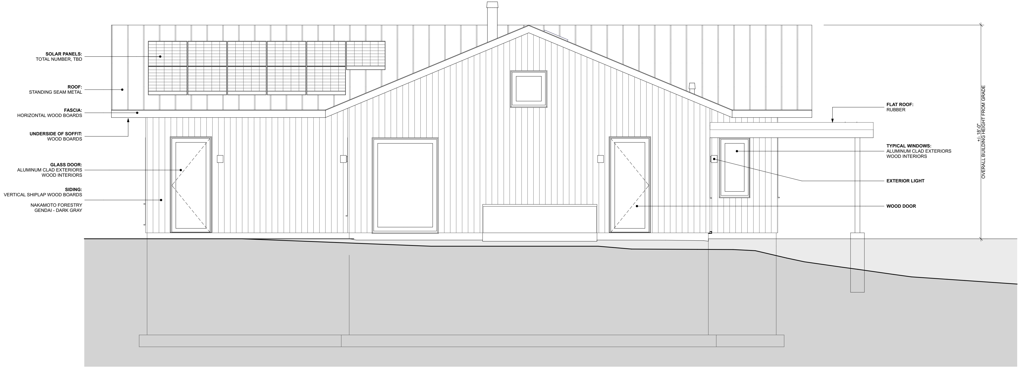
2 SOUTH ELEVATION SCALE: 1/4" = 1'-0"