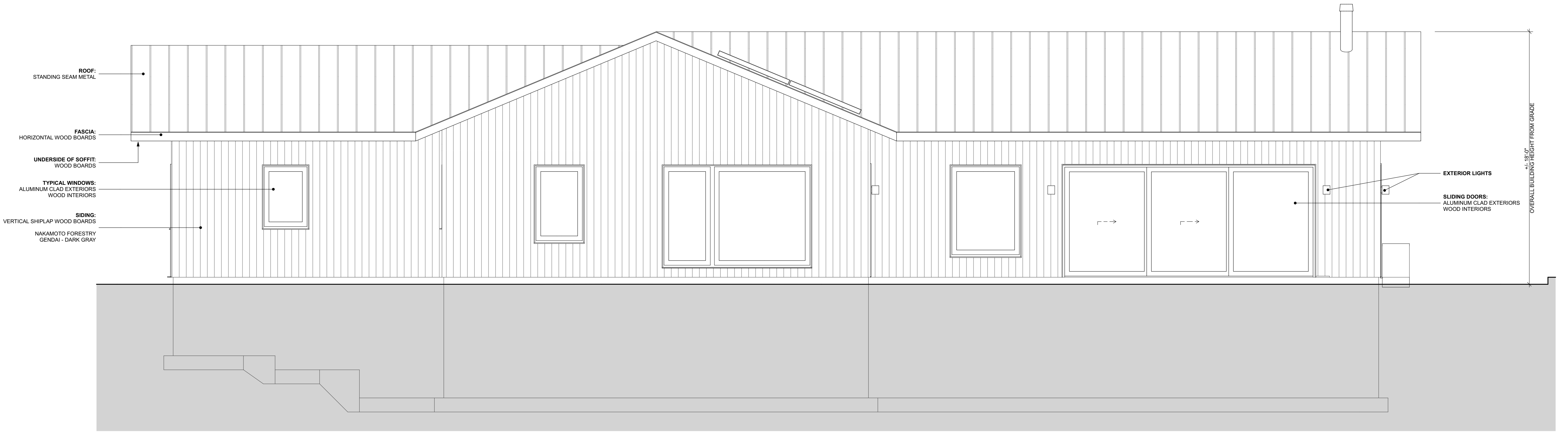
1 WEST ELEVATION SCALE: 1/4" = 1'-0"