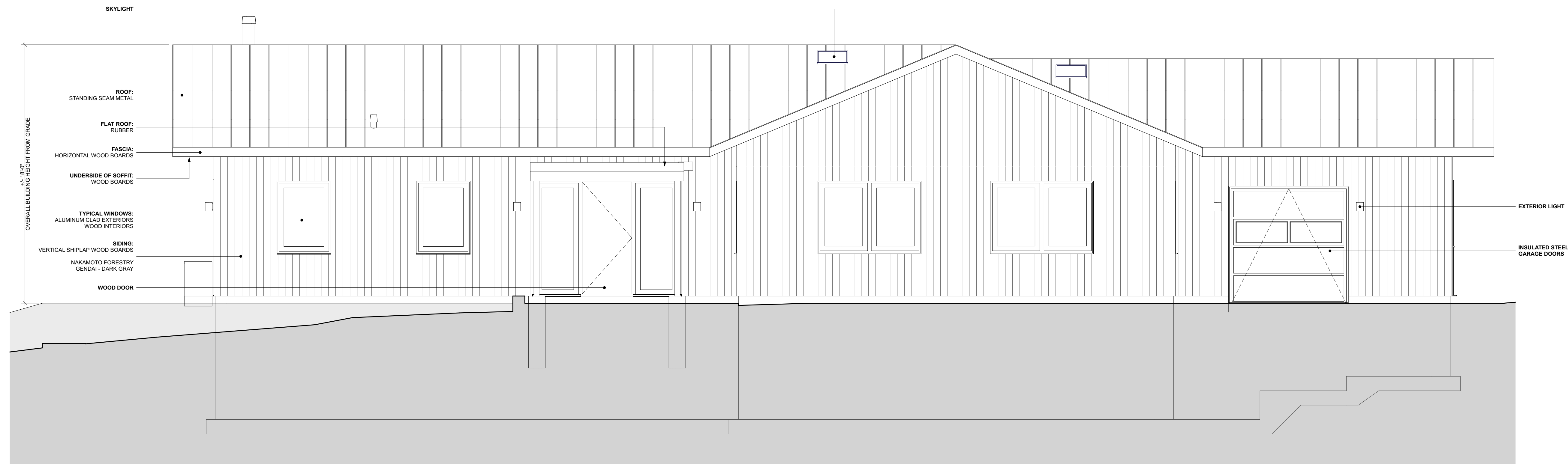
1 EAST ELEVATION SCALE: 1/4" = 1'-0" 0 2 4 8