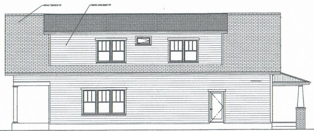
SIDE 1 ELEVATION 1/4"=1'-0"