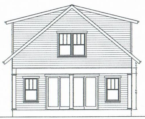
BACK ELEVATION 1/4"=1'-0"