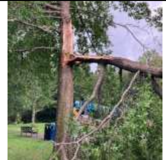
Appletree Park and Lakeview