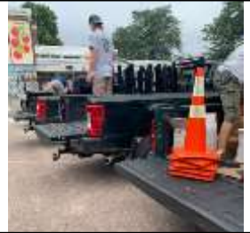
Cleaning at Schmanska Barn