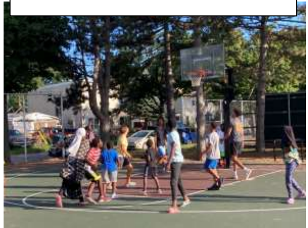
Roosevelt Park – Recreation Nutrition site