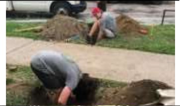
Running power to Dewey Park