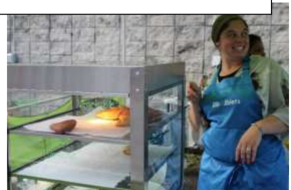
Fabulous summer of Leddy Beach Bites!