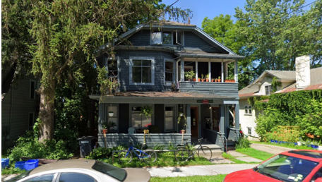
1. Fourplex 287 S Winooski Ave.

These highlighted examples show massings, building forms, parking locations, and site designs that are consistent with best-practice for Missing Middle Housing (MMH) types. Each example may not be the exact type noted, but they all contain multiple units and represent good examples of MMH in form. There are many more examples of MMH along the route. Keep an eye out for others that you think are good examples!