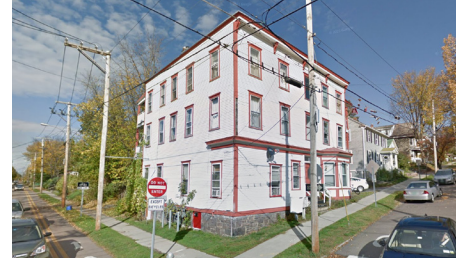
3. Multiplex (UMM*) 54 Spruce St.