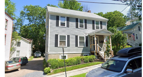
4. Triplex 60 Spruce St.