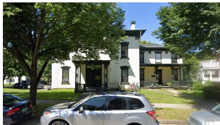
10. Multiplex 217 S Union St.