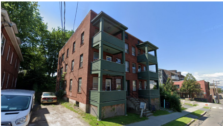
17. Multiplex (UMM*) 199 King St.