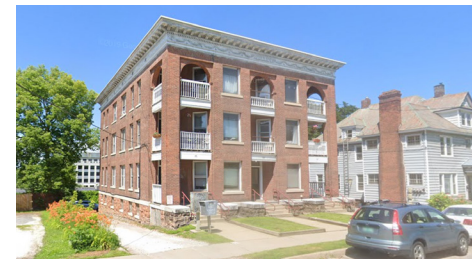
12. Multiplex (UMM*) 171 S Union St.