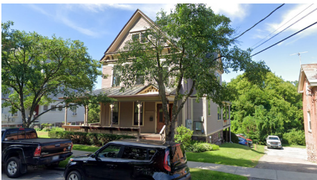
9. Duplex 257 S Union St.