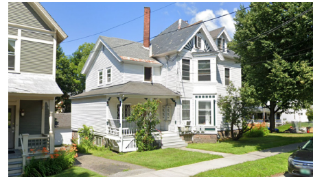
19. Multiplex 203 Maple St.