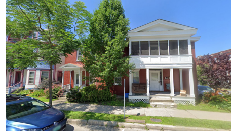
15. Triplex 153 S Union St.