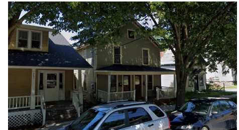
20. Duplex Side-by-Side 255 S Winooski Ave.