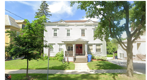
8. Multiplex 311 S Union St.