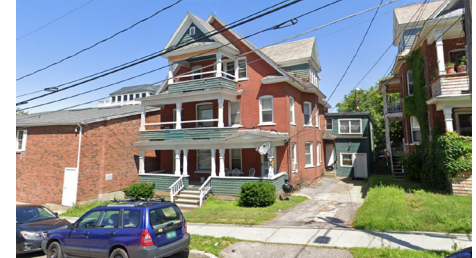
16. Sixplex 200 King St.