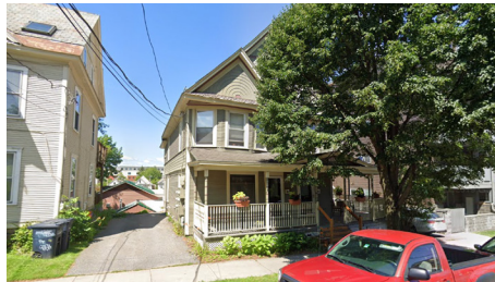
18. Multiplex 197 S Winooski Ave.