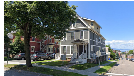
11. Multiplex 193 S Union St.