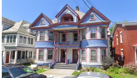
14. Sixplex 157 S Union St.