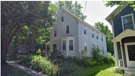
5. Duplex Stacked 63 Spruce St.