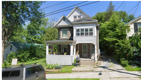
6. Fourplex 74 Spruce St.