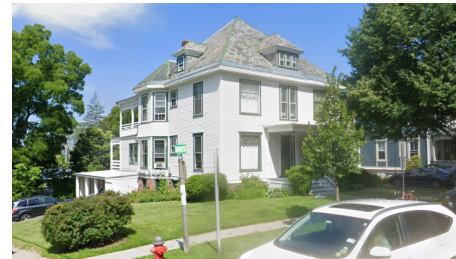
7. Multiplex 335 S Union St.