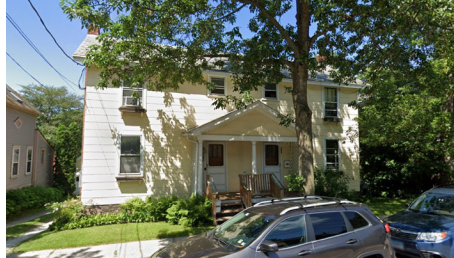
2. Duplex Side-by-Side 309 S Winooski Ave.