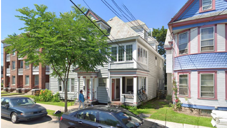
13. Duplex Stacked 163 S Union St.

These highlighted examples show massings, building forms, parking locations, and site designs that are consistent with best-practice for Missing Middle Housing (MMH) types. Each example may not be the exact type noted, but they all contain multiple units and represent good examples of MMH in form. There are many more examples of MMH along the route. Keep an eye out for others that you think are good examples!