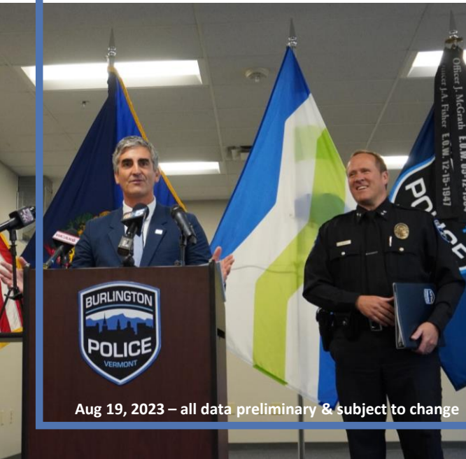
Aug 19, 2023 – all data preliminary & subject to change