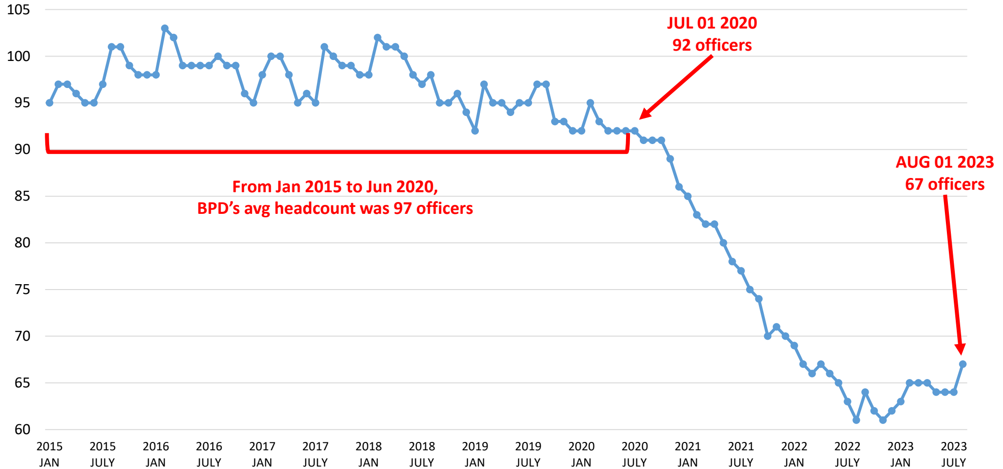
TOTAL SWORN HEADCOUNT, as of the first of each month, month-by-month