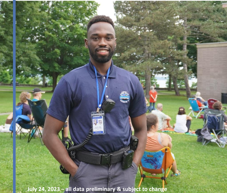
July 24, 2023 – all data preliminary & subject to change