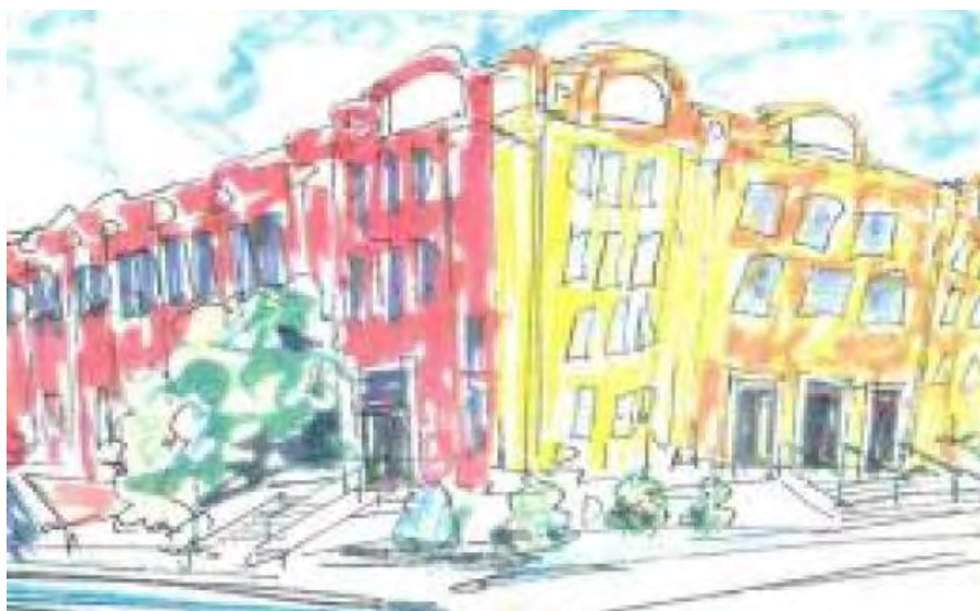
Burlington City Arts 1995

Our team has strong New England roots and many of us are well known across state boundaries for our public service and our successful projects. We have read carefully through the research, strategy and planning documents and appreciate the time and attention given to this project. Burlington cares about its growth and works to support a vision for current residents and future growth. Our goal is to offer ideas that support the growth of the area that is in alignment with the City's vision. We look forward to discussing our proposal and forging working partnerships with all those who care so deeply about this project and have a stake in its success.