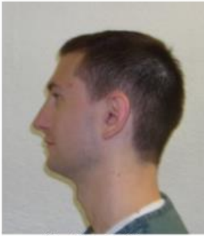
(Profile - Left)