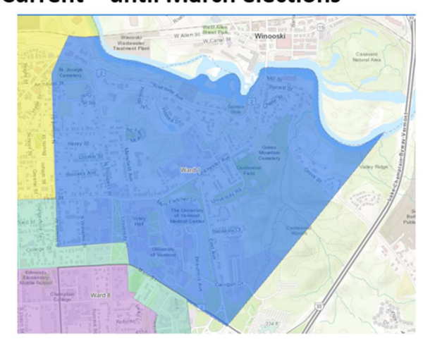
Current – until March elections