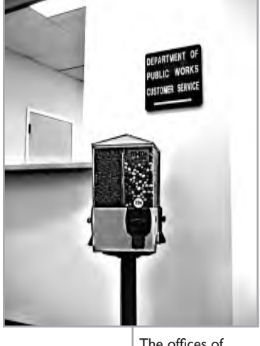
The offices of Public Works have candy for your enjoyment.

"When can I see an inspector?" The inspectors have set aside certain office hours, 8 am to 10 am, specifically to return phone calls, schedule appointments, and meet with walk-in customers. These hours were set up to issue quick permits and answer any questions you may have to keep your project moving. Voice mail can also be an important tool. For building permits call (802) 865.7559; for electrical permits call (802) 865.7561; for mechanical, heating, ventilation, sprinkler, and plumbing call (802) 865.7560.