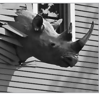
How about a rhino? Contact the friendly staff at Planning & Zoning.