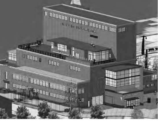
7th Ed., June 2010