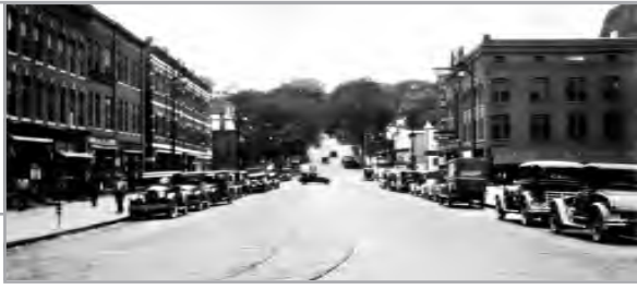
Main Street, looking east from Church Street, 1937