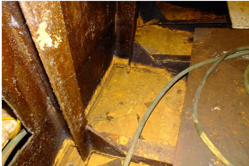
Forward rake, showing rust/scale at bulkhead.

UT of side shell plating, .313" as plated