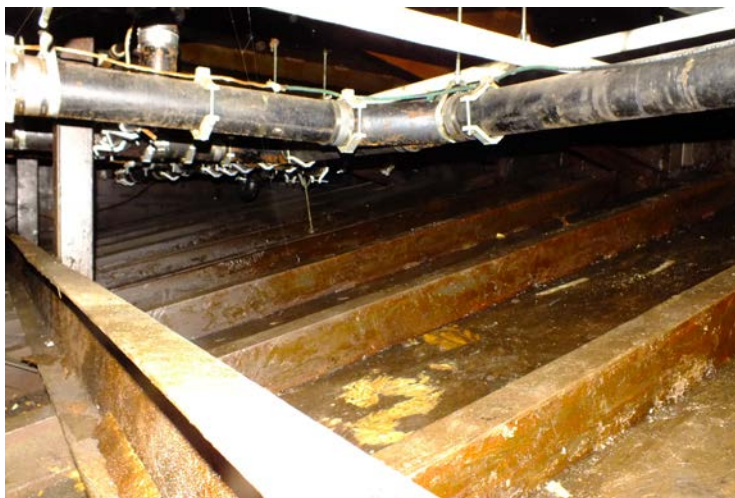
Overhead piping within the aft rake, notice good material condition of longitudinal frames.