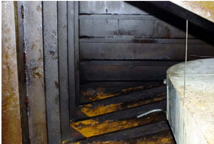
Looking to starboard across aft rake at bulkhead.

Condition of aft rake (north end) is good with minimal plate loss observed. With the exception of the low bilge area of the rake (moderately scaled) the side shell plating, deck and framing are in excellent material condition. All steel in this compartment coated with a preservative mastic (composition unknown).