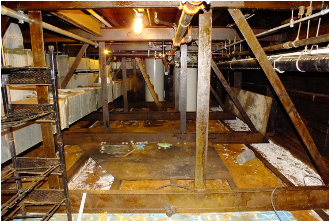
Tank #1, looking aft to hot water heaters.