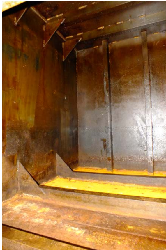
Tank #3, looking at base of aft inboard corner of tank.

Side shell plating (.313"), bow to stern, at wind/waterline on 4' centers