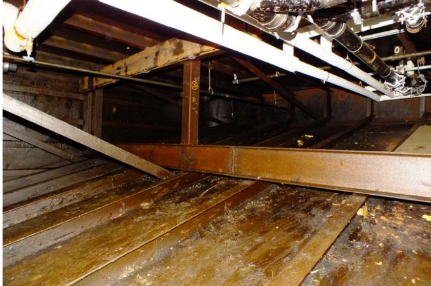
Forward rake of barge looking to port.

Condition of forward rake (south end) is good with minimal plate loss observed. With the exception of the low bilge area of the rake (moderately scaled) the side shell plating, deck and framing are in excellent material condition. All steel in this compartment coated with a preservative mastic (composition unknown).