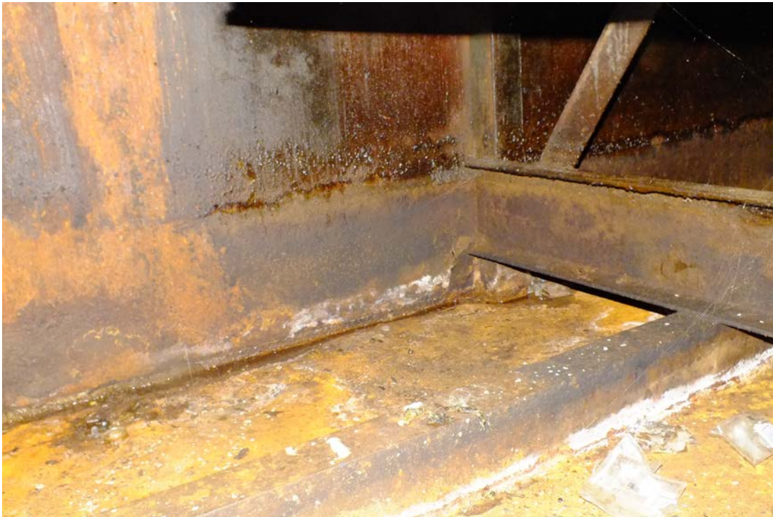
Centerline vertical longitudinal bulkhead intersection bottom shell plating. Notice wastage of weldments and heavy corrosion.