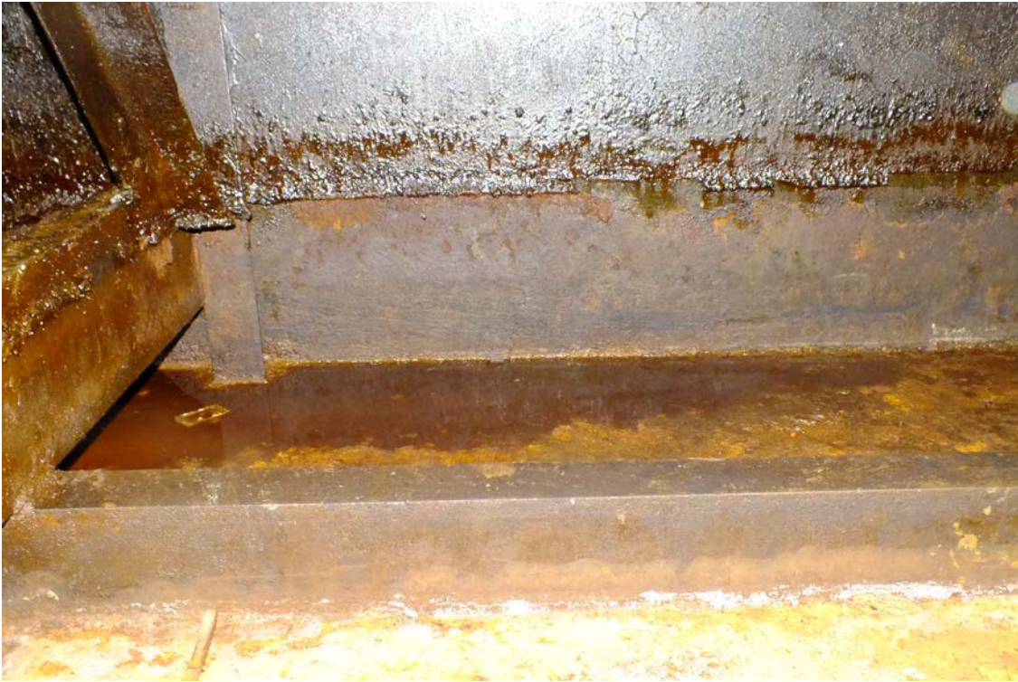
Tank #2. Wasted bottom plating against centerline longitudinal bulkhead showing standing water.