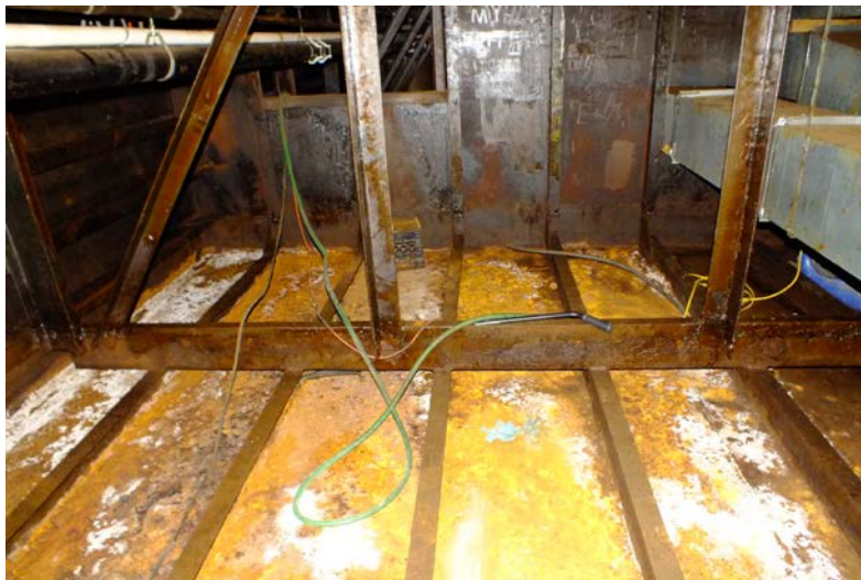
Tank #2, looking forward; outboard plating is to the left.

Replace bottom 1' x 35' of centerline bulkhead where it intersects bottom shell plating.