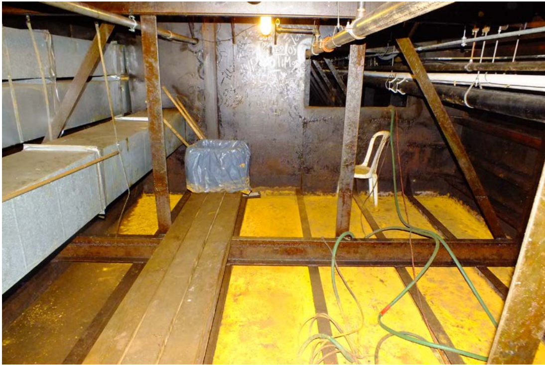
Tank #1, port side forward looking aft to Tanks #3 behind bulkhead. Notice rust/scale in bilges