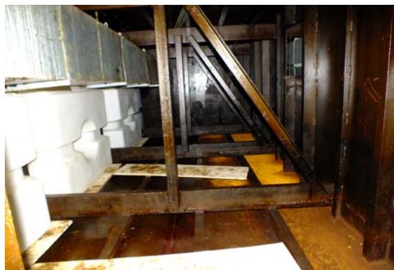
Tank #3. Looking aft with ballast tankage outboard.

Conduct a proper inclining experiment to determine stability to ensure proper loading/safety and stability of the barge.