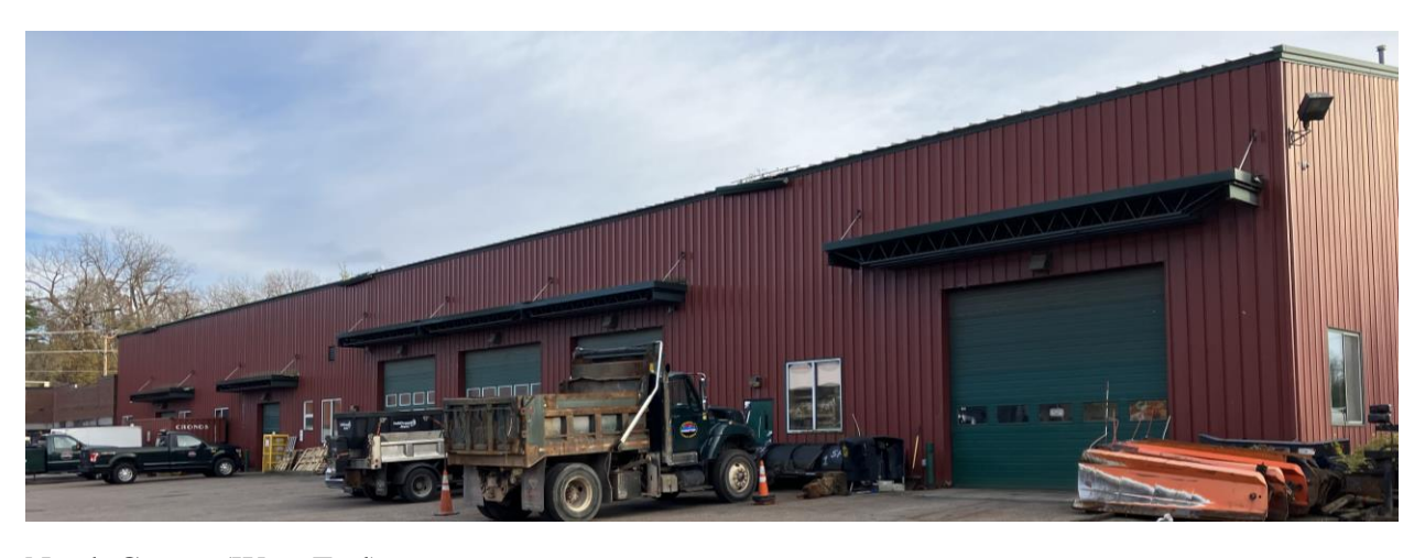
North Center (West End)