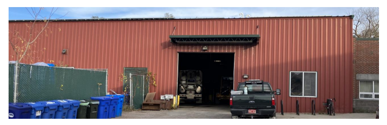
West Center (South End)