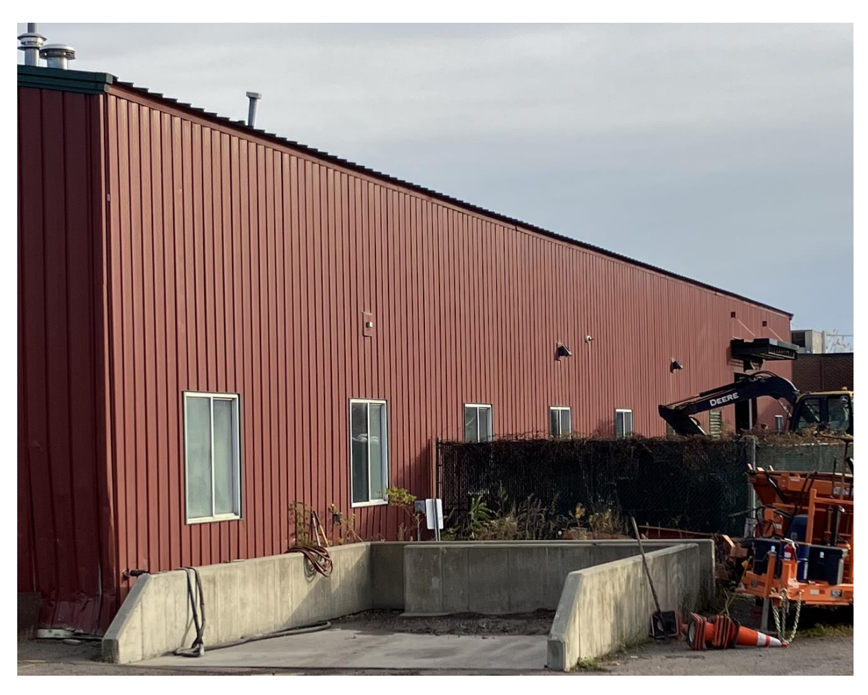
West Center (North End)