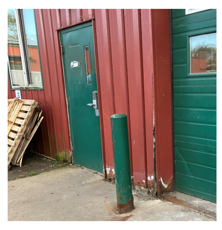
Detail of North Center