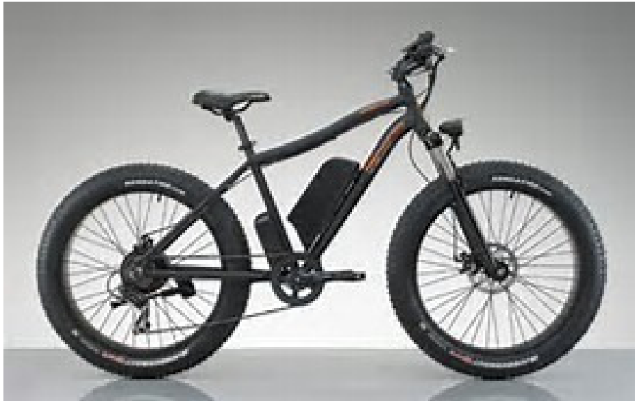
Stolen Rad Rover Electric Bicycle (likeness)