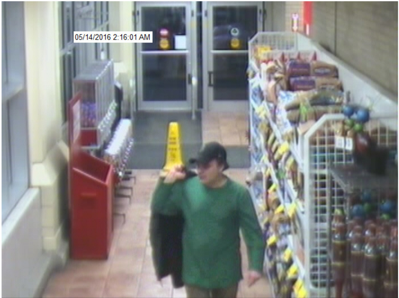
POI photo 2