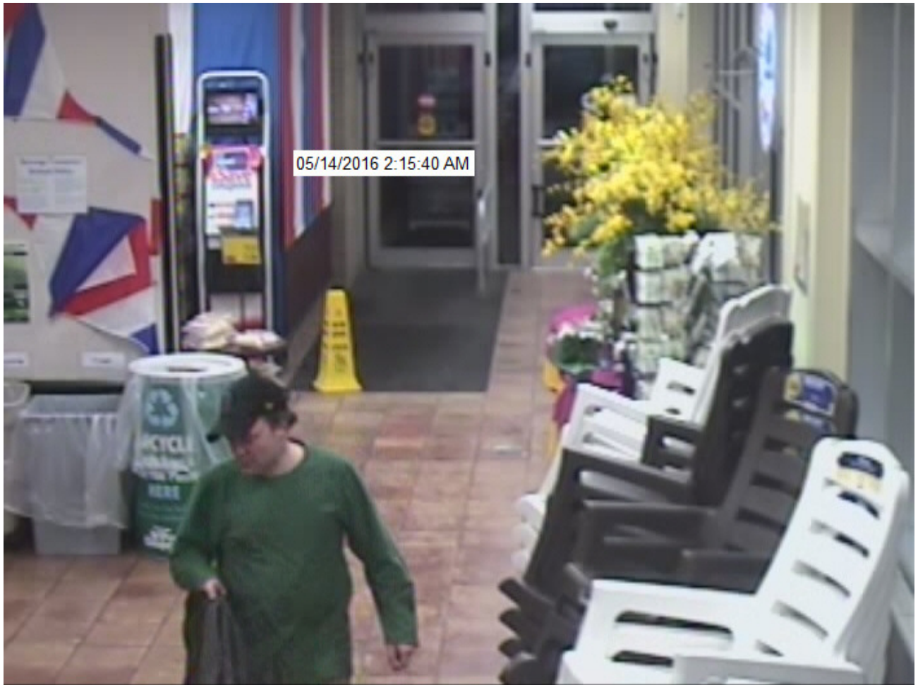
POI photo 3