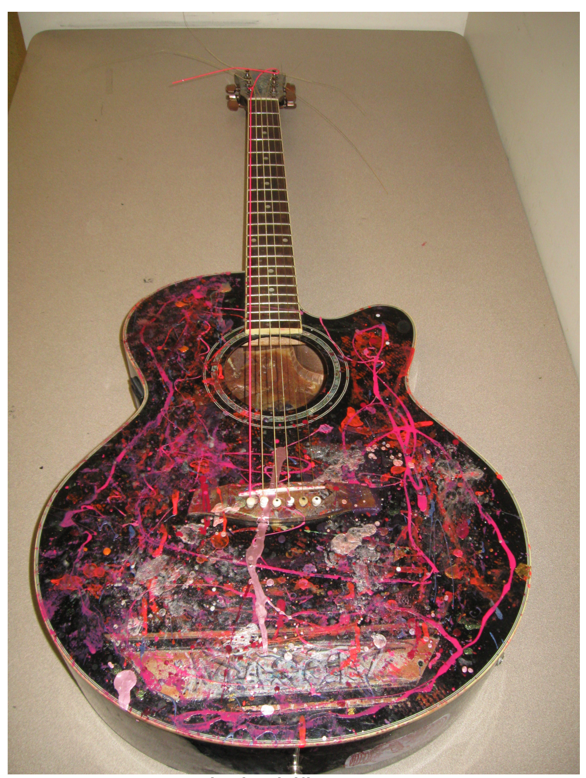
Guitar placed on shelf by suspect